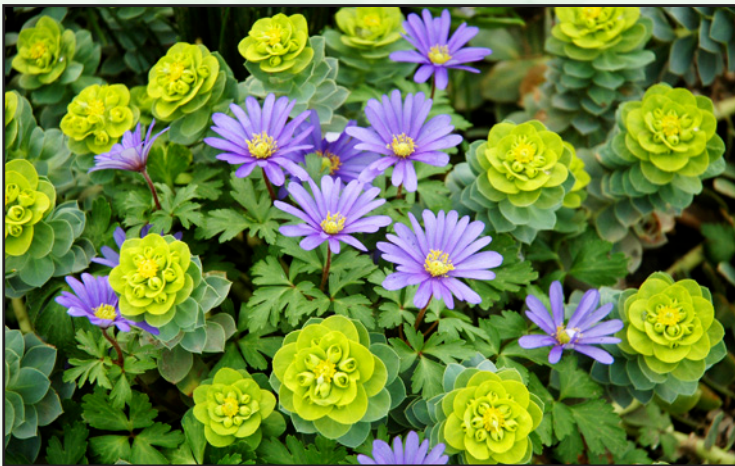
A combination of Euphorbia myrsinites and Anemone blanda work well in this mini tapestry

As I look out upon my own garden I realize this year has been an easy time for the gardener and garden alike. Plants are flourishing, the past moderate temperatures and generous amounts of precipitation makes the task of gardening rewarding and easy. Bare spots quickly become full of overlapping plants and the garden tapestry melds as if woven on some great loom. I wish I could take full credit for the vision before me but alas the credit belongs to the plants themselves. In 1883, William Robinson, a gardening revolutionary wrote “The various wants of flowers can be best met, and their varied loveliness fully shown, in a variety of positions” In essence, wherever they’ve been placed, the plants beauty would be appreciated for what they are.